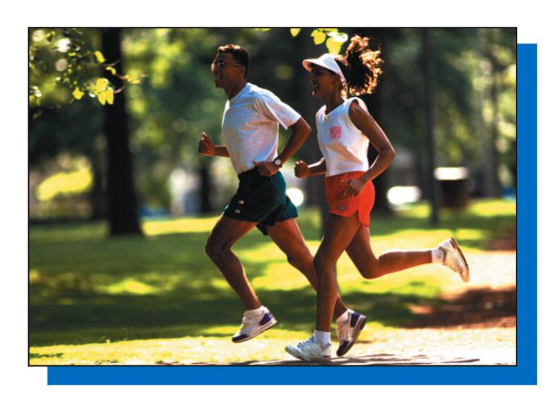
Ellos corren en el parque.